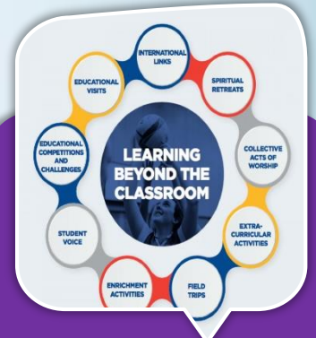
Beyond Curricular Learning