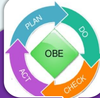
Outcome Based Education