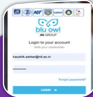
Learning Management System