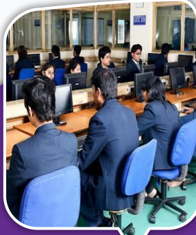
Laboratory / Virtual Lab