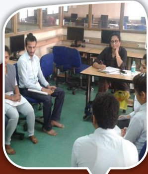
Group Discussion / Presentation