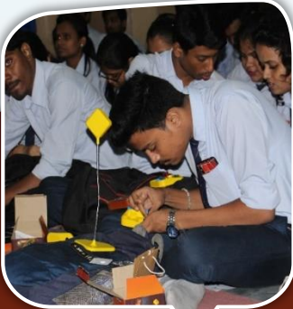
Project Based Learning